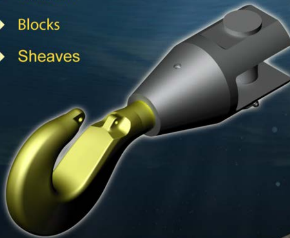
PLET Anchoring Hook Assembly 300 metric tons working load